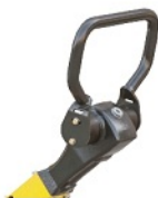
Precise and save to operate Comfortable control lever