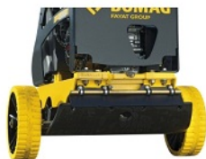
Simple and safe transport Transport wheels (optional)