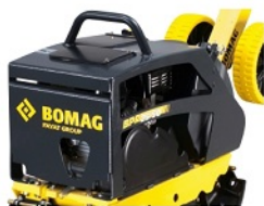
Robust and reliable Best component protection